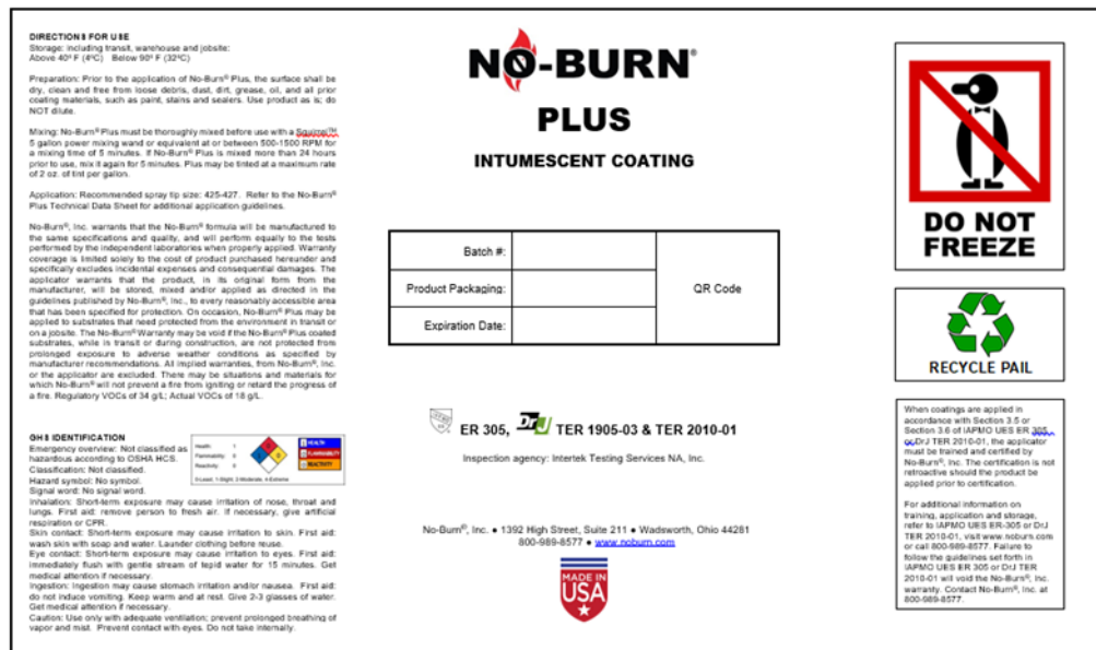
Figure 1. No-Burn® Plus