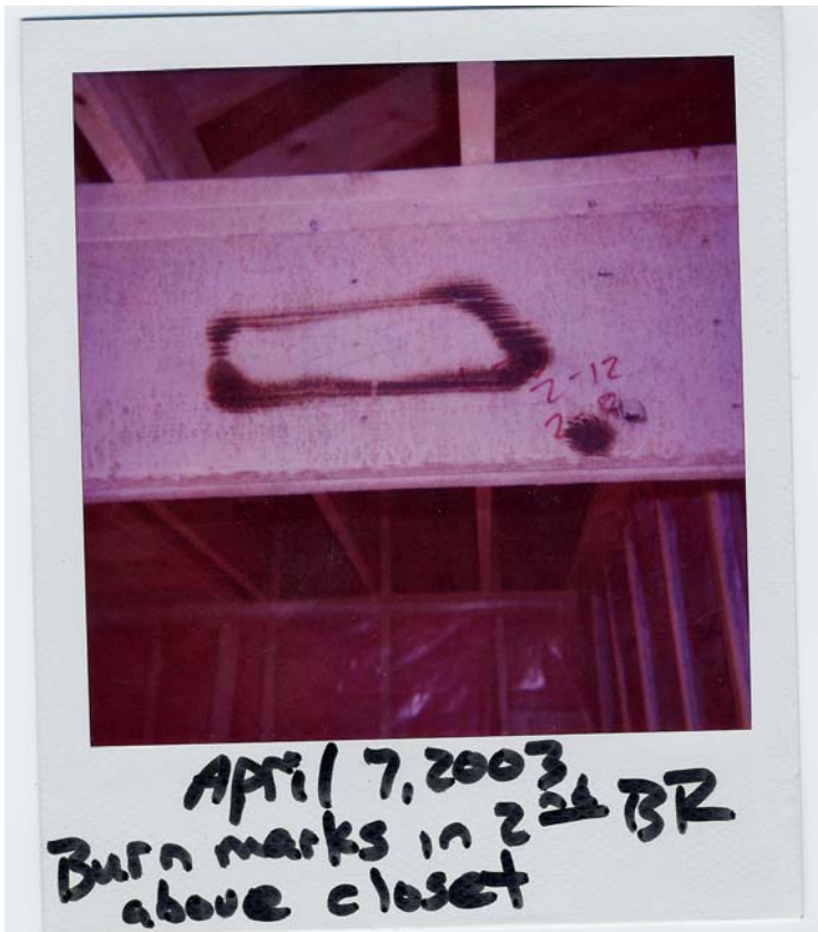
April 7, 2003 Burn marks in 2 nd BR above closet